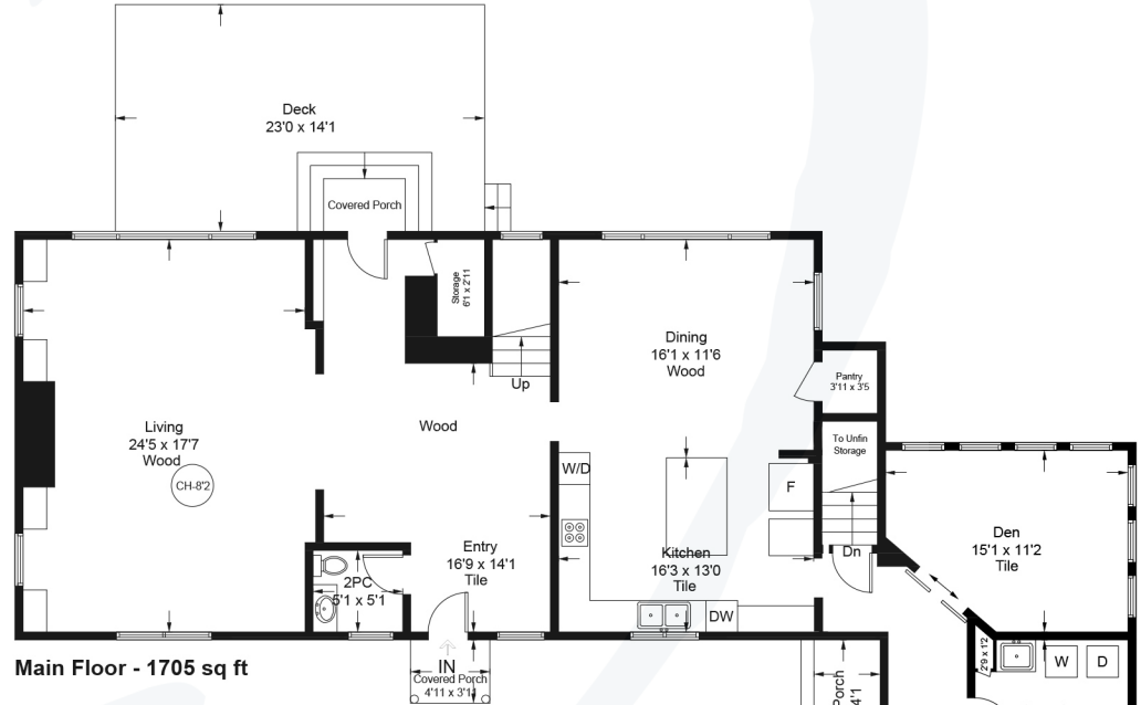
Main Floor - 1705 sq ft