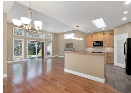
61 - 2300 MURRELET DRIVE